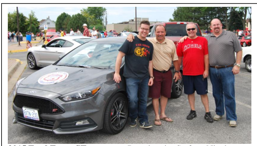
2015 Ford Focus ST