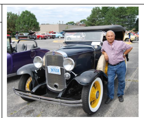
1931 Chevrolet 4 Door Convertible Indipendent Series