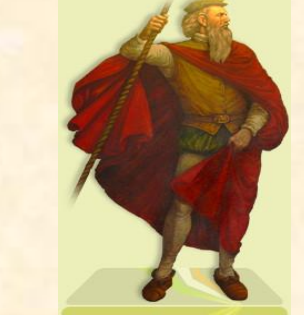
Giovanni Caboto di Saverio Galli